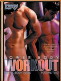
Lower Body Workout D1022

Five beautiful men bare it all to show you the first ever exercise experience that is both informative and visually intriguing! From a warm-up stretch routine performed by a championship gymnast, to a rigorous triceps program demonstrated by a national heavyweight bodybuilder, you will be taken through a complete conditioning routine for the upper body performed fully nude.